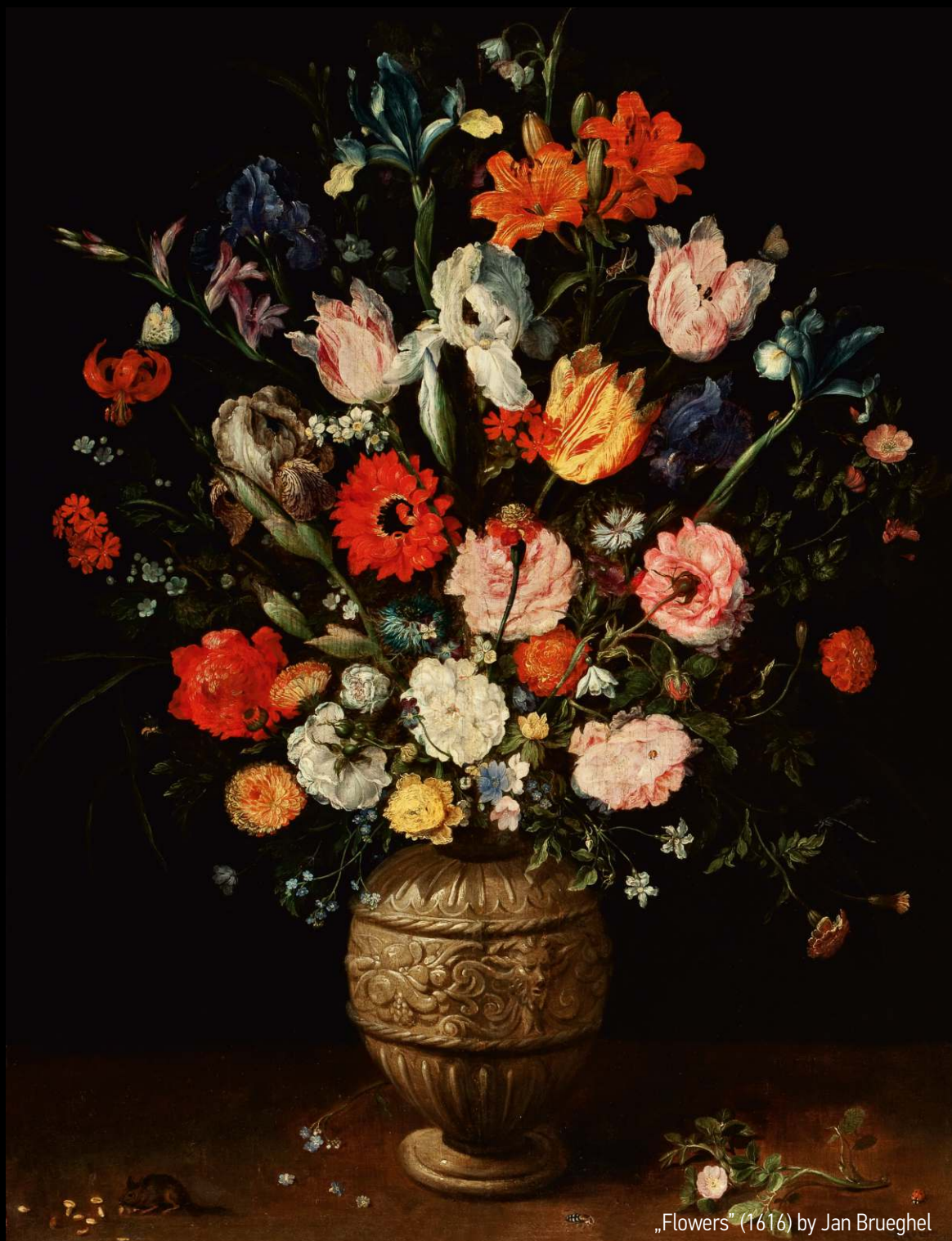
Framed with Artglass Protect™ 22.1 and displayed in National Museum in Belgrade, Serbia

With Artglass™ you can protect your treasured artwork and fully enjoy its beauty without reflections.